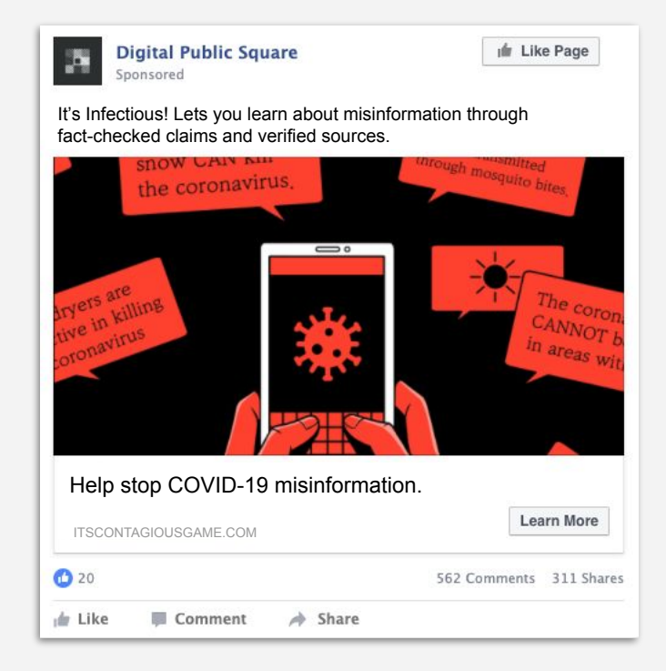
Game focused 3b