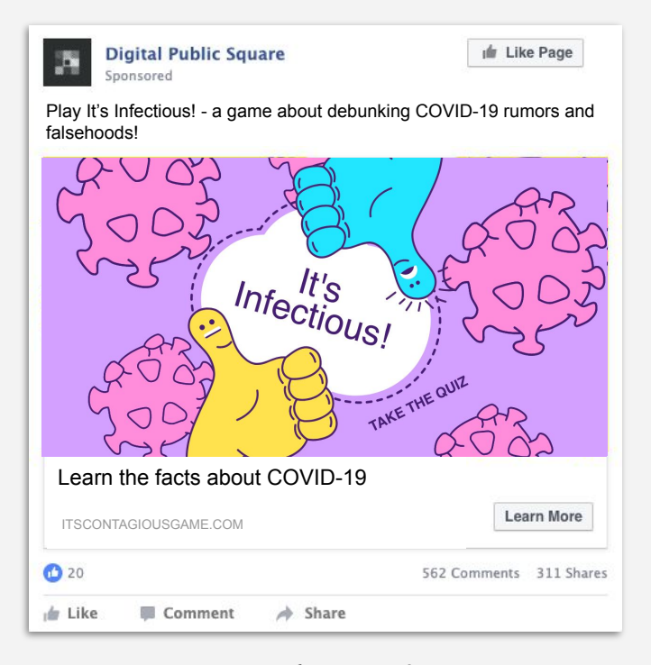
Game focused 2a