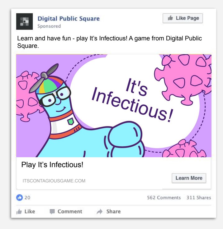
Game focused 1b