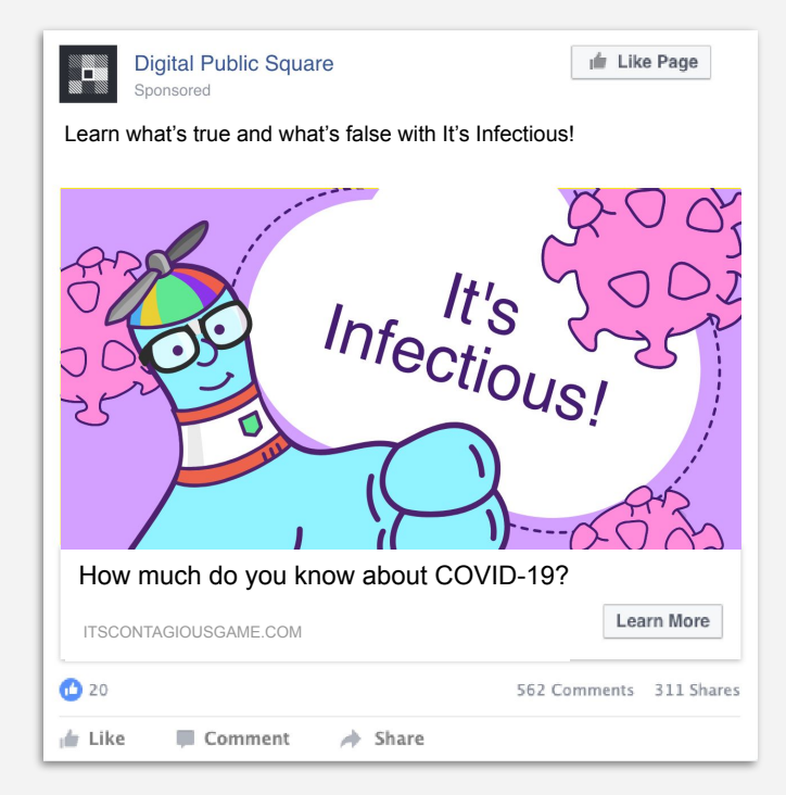
Accuracy focused 2