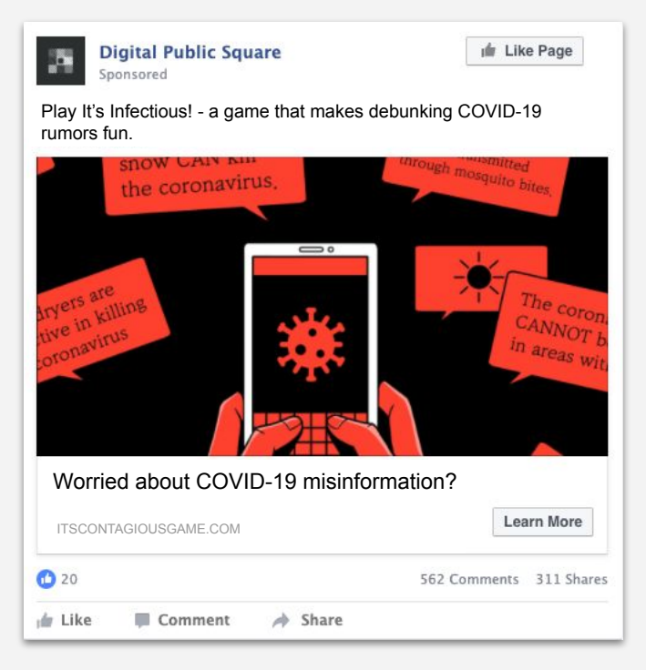
Game focused 3a