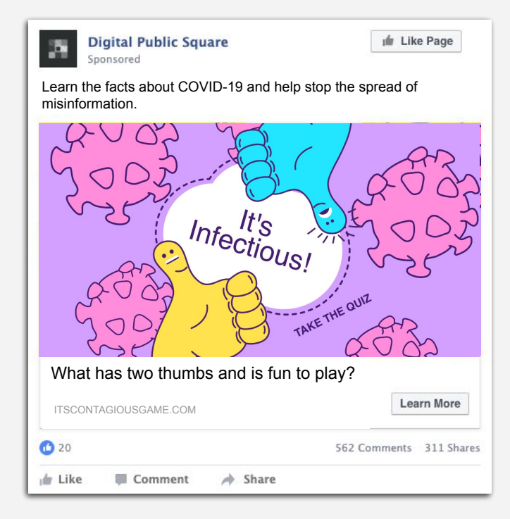
Game focused 2b