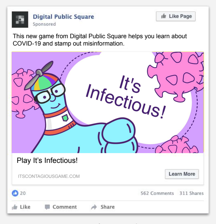
Game focused 1a