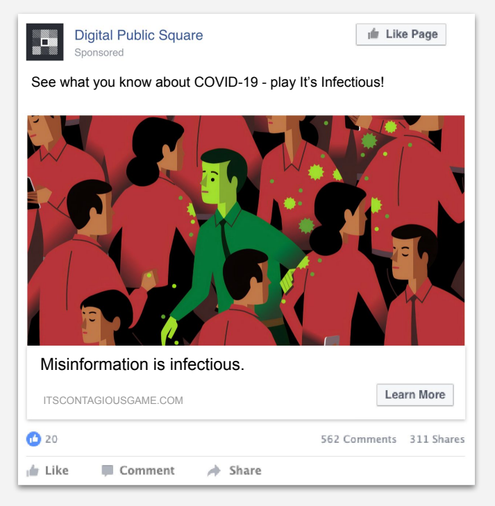
Accuracy focused 1